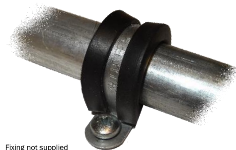
Fixing not supplied